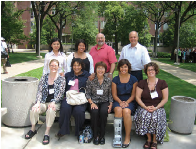
2008 Midwest SAPh Conference in Chicago —graduate students and faculty attended. The next meeting will be in 2010 in Iowa