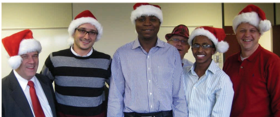
Faculty and Student group photo from the SAPh Get-together for a “funny gift exchange” December 2011